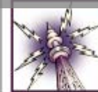
TeamQuest On the Web